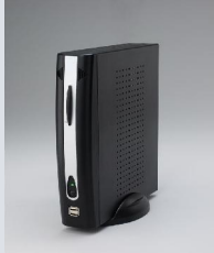
XLT 1200S Series